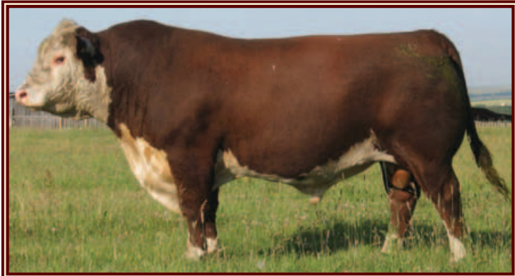
HARVIE RAFTSMAN 16R C02865314 SIRE: HARVIE LADIES MAN 4L DAM: HARVIE MS FIREFLY 51F