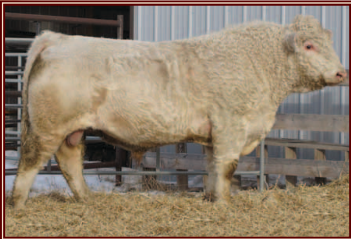
WINN MANS VINAZA 815U MC322576 SIRE: WINN MANS LANZA 610S DAM: WINN MAN SEDUCTIVE 052K