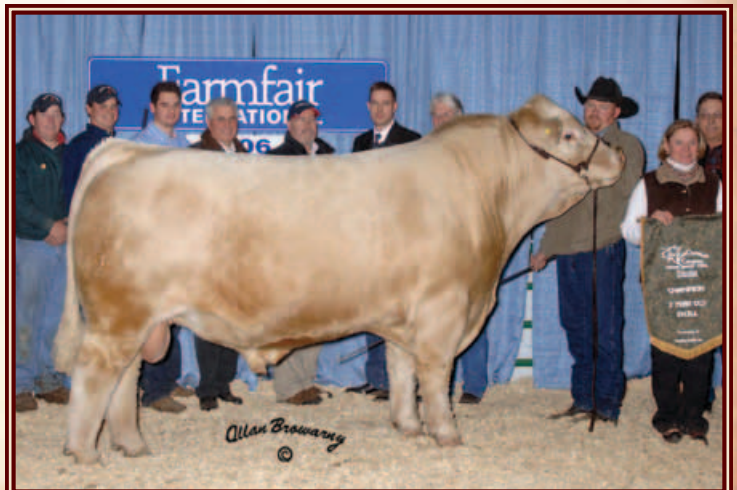
HARVIE REDEMPTION 36P MC286641 SIRE: LT WYOMING WIND 4020 PLD DAM: HARVIE MS MOLSON 53M