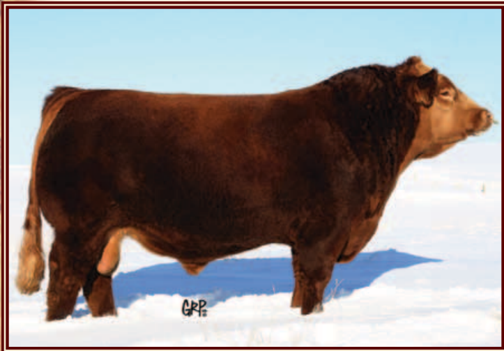
REMINGTON GENERALLEE 106T