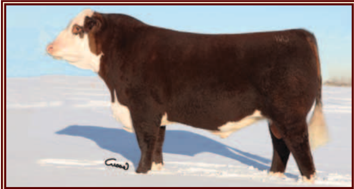
HARVIE TRAVELER 69T C02895589 SIRE: KAIRURU ABERDEEN 03 0047 DAM: HARVIE PEARL 129P