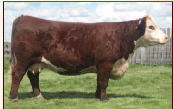
A daughter of Harvie Ladies Man 4L

Moderate framed, dark red, low birth weight and lots of body. 97X's dam has a picture perfect udder, an ideal kind of female that we like to duplicate.