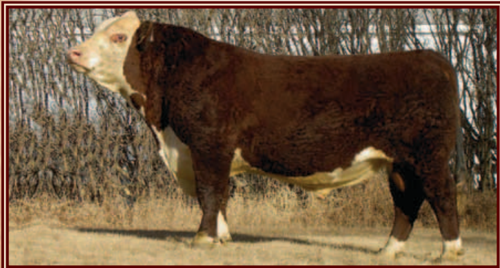
HARVIE LADIES MAN 4L C02780997 SIRE: HARVIE HILLS 68H DAM: HARVIE MISS JULIE 9J