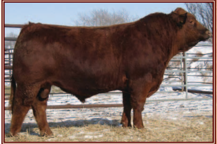
HARVIE CRYSTAL D TRIGGER 35T RMC31733 SIRE: MAUNGAHINA TOWKAY T13 DAM: HARVIE MS MOLSON 53M