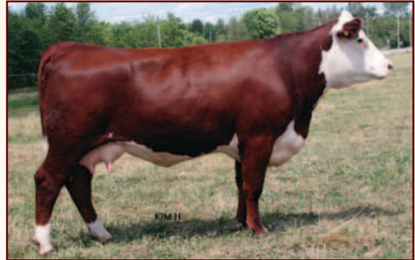
Dam of Lot 39

Here's the youngest bull in the sale but he sure doesn't give up an ounce of size or performance to any bull in the sale. His dam was the high selling female in Canada as a bred heifer a couple of years ago.