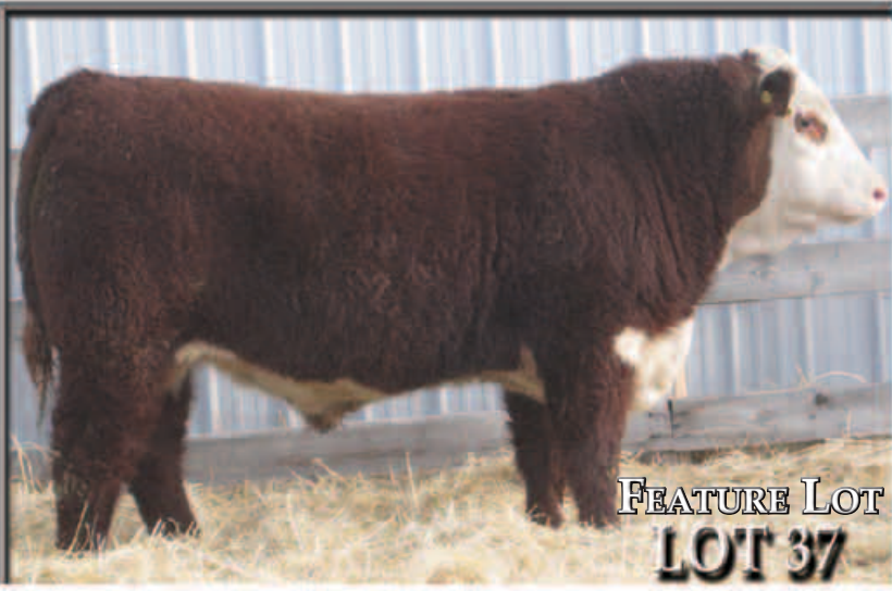
FEATURE LOT LOT 37