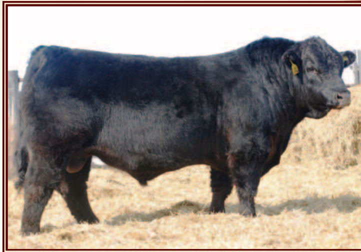
SRINGCREEK LINER 56U

SIRE: REMINGTON RED LABEL HR DAM: DRAKE SOFT TOUCH 15M