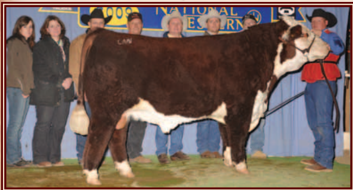
HARVIE DAN T-BONE 196T C02900184 SIRE: KAIRURU ABERDEEN 03 0047 DAM: HARVIE MS FIREFLY 65P