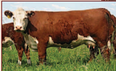
Full sister to the dam of Lot 41

Super long bodied, big topped, and has performance to burn. His dam is a typical 'Ladies Man' daughter that is easy doing, moderate framed, with a perfect udder.