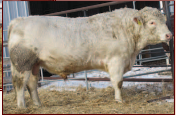
Maternal brother to Lot 3 - sold to Pleasant Dawn Charolais last year.

40X is solid made with a tremendous amount of stretch. We used his maternal brother in our herd last year, and now he runs the pastures at Pleasant Dawn Charolais. Here is an opportunity to get your hands on a bull that will help shape your herd.