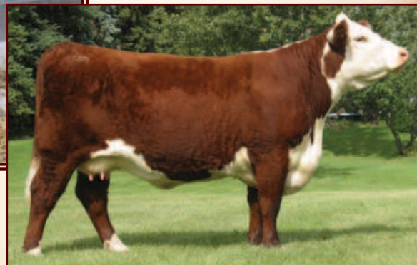
Dam of Lot 44

Here's a young bull that is the highest gaining bull on offer. He is a rugged made bull with lots of substance to him. We have sold 3 maternal brothers to 158x that are working well in purebred operations.