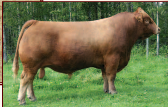
Sire of Lot 49 - 2010 Canadian National Champion Bull

He's not the prettiest bull in the sale, but man he is a soggy, rugged made with piles of hair. His sire was Canadian National Champion Bull at Brandon in 2010. His dam is a big broody female that we put in our donor program last spring.