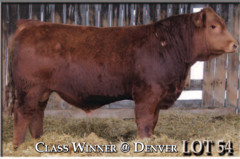
CLASS WINNER @ DENVER LOT 54