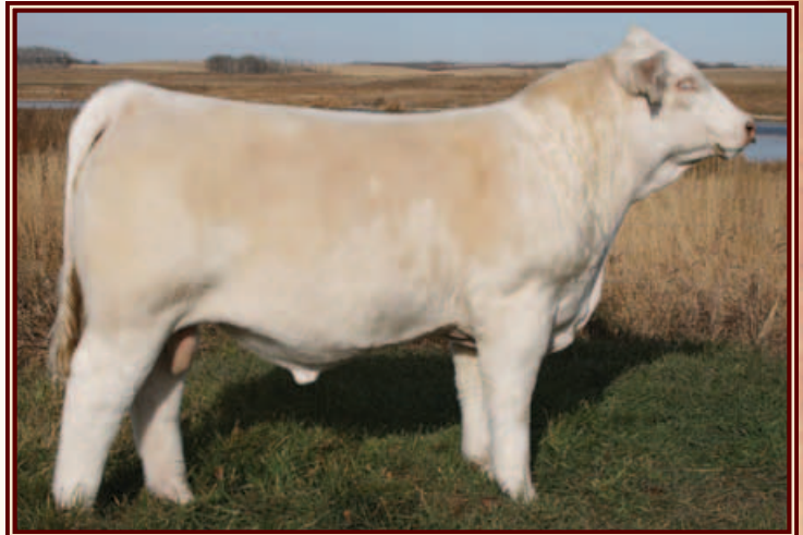
SVY AD INVINCIBLE P 748T MC309953 SIRE: DBAR SURVIVOR 220M DAM: PLEASANT DAWN PAM 214J