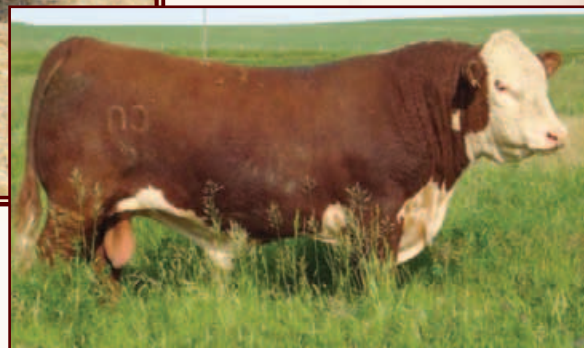
GHC-Taboo Coalition 52U - paternal brother to Lot 43

What a tank! 80X is a stout made, super easy doing bull that would work in the heifer pen. 80X is off a first calf heifer that comes from our world famous 'Firefly' cow family.