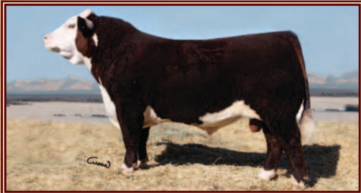
HARVIE DAN RICOCHET 167U C02912999 SIRE: HARVIE SENSATION 265 DAM: HARVIE DAN MS FIREFLY 69S