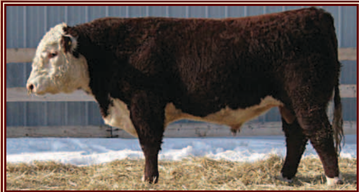
HARVIE TARGET ET 173T C02909060 SIRE: MC RANGER 9615 DAM: HARVIE MISS HILARY 90H