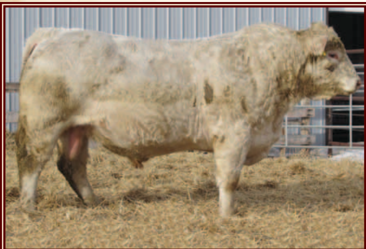
LLW DOUBLE L HARVIE 123U MC320306 SIRE: HARVIE STINGER 2R DAM: BAR 7 EASY RUMOR 55R