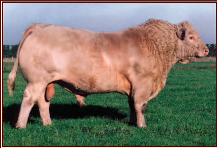
SILVERSTREAM PERFORMER P38 FMC8325 SIRE: EXCLUSIF DAM: SILVERSTREAM HOUGHTY H83E