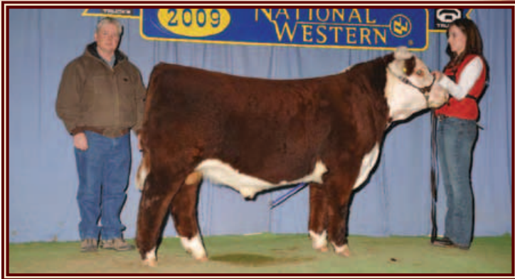
HARVIE OVHF WALK HARD 154U C02780997 SIRE: HARVIE RAFTSMAN 16R DAM: BBSF 100L UNIQUE ET 131R