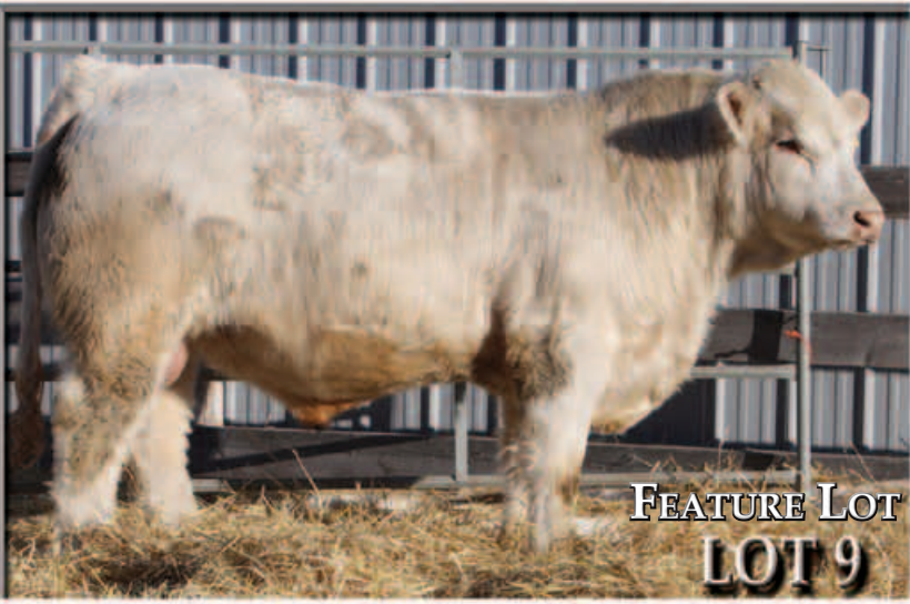
FEATURE LOT LOT 9