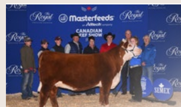
Dam, Riesling 3F