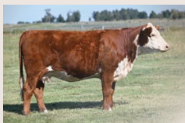
Dam of Lot 5