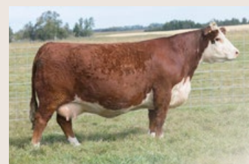
Dam of Lot 6