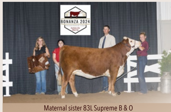
Maternal sister 83L Supreme B & O