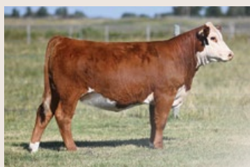
Maternal sister Lot 12, Monique 34M