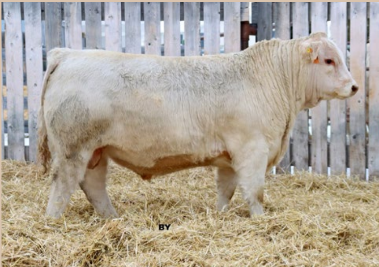
Turnbull's Jabba 25J, reg# 813576

High Selling Bull at the SOS 2022 Bull Sale