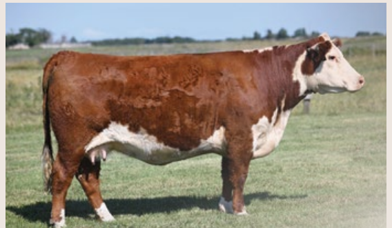
Dam of Lot 4