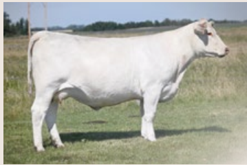
Dam of Lot 20