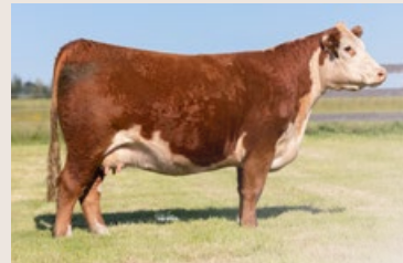
Dam of Lot 16