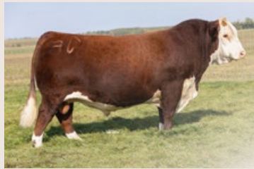
Commitment 137J, Sire Lot 12