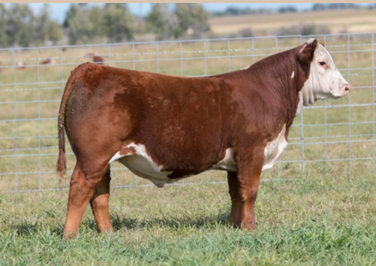
Harvie OVHF Hudson ET 174H, reg# C03071110