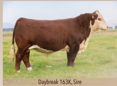
Daybreak 163K, Sire