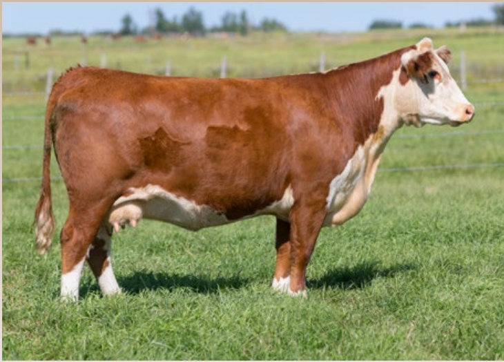
Harvie Ms Firefly 84F Reg # C03044932