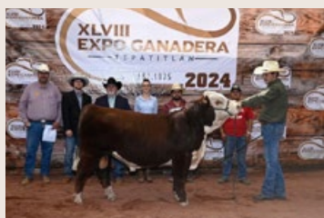
Firefly progeny winning under the El Sauz prefix.