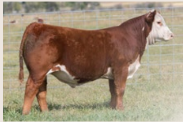
Hudson 174H, Sire Lot 11