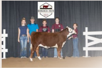
9M, Rs Bonanza B&O Calf, '24