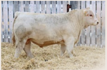
Jabba 25J, Sire