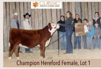
Champion Hereford Female, Lot 1

Ms Firefly ET 79M is donor cow material! Firstly, her design is flawless; she's wide based, long bodied with extra rib shape. She has full pigmentation on a beautiful head to match her overall maternal appeal. Her dam Ms Firefly 125Y has continued to gain popularity in her 13th year in production as she recently produced Momentum ET 35L the 2023 CWA Reserve National Champion Bull who accompanied his full brother Thrill Seeker 48L to the 2024 Reserve National Champion Carload in Denver, USA. Both maternal siblings to 79M walk the pastures at Fawcett's Elm Creek Ranch in SD, USA. Her full brother in 2024 is in the show pen as we prepare him to be apart of the 2025 NWSS Harvie Ranching Carload. We are retaining ½ interest and possession on Ms Firefly ET 79M, she is a CWA Supreme Qualifier.