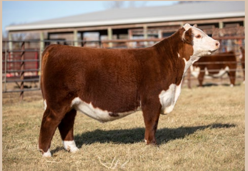
Land Makers Mark 2072 ET, reg# C03108516