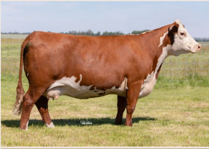
SSAL 4172 Unique Empress 21E Reg # C03034037

HARVIE MS FIREFLY ET 19F X NJW 73S D287 DAYBREAK 163K ET