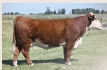
Monique 89J, Dam of Lot 13