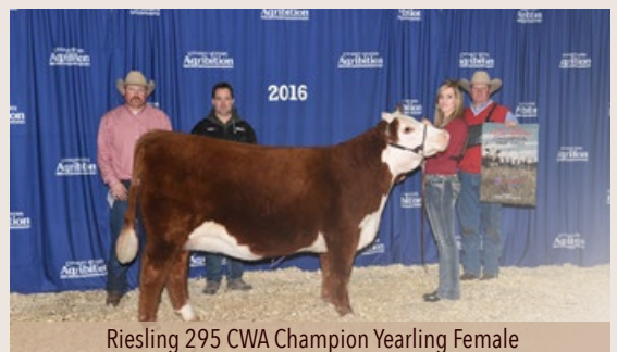
Riesling 295 CWA Champion Yearling Female