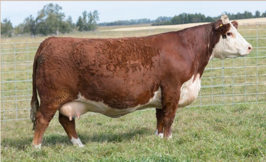
Harvie Ms Medonte 236D Reg # C03027791

H 3 EXPORTABLE SEXED FEMALE EMBRYOS 23A MS MEDONTE 236D X KJ 7603 ELEMENT 019L ET