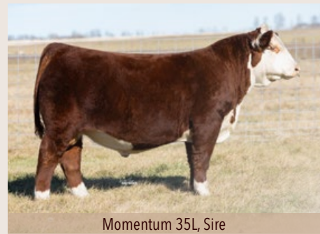
Momentum 35L, Sire