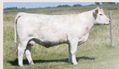
Dam of Lot 19