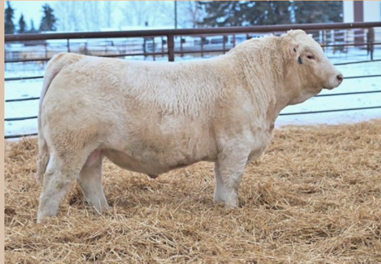
SOS Jackpot PLD 158J, reg# 815944

High Selling Bull at the SOS 2022 Bull Sale