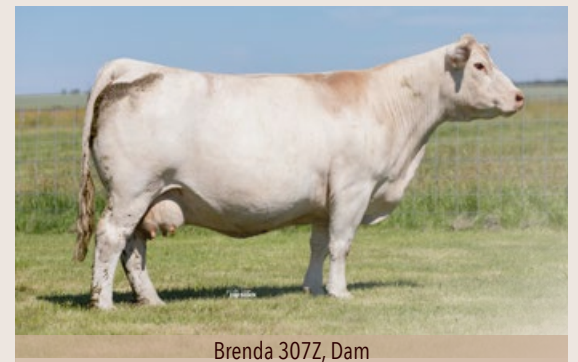
Brenda 307Z, Dam

Harvie Brenda 38M is a stunning female from Jill's favorite Charolais donor female Brenda 307Z. 307Z is the deepest, longest sided female on the ranch who always has the truck stop on a cattle tour. This flush was a tremendous success, with a resulting group that are consistently strong. Brenda 38M has an appealing silhouette that lends itself to be a winning option in the show ring. You'll see Brenda on the show road this fall.