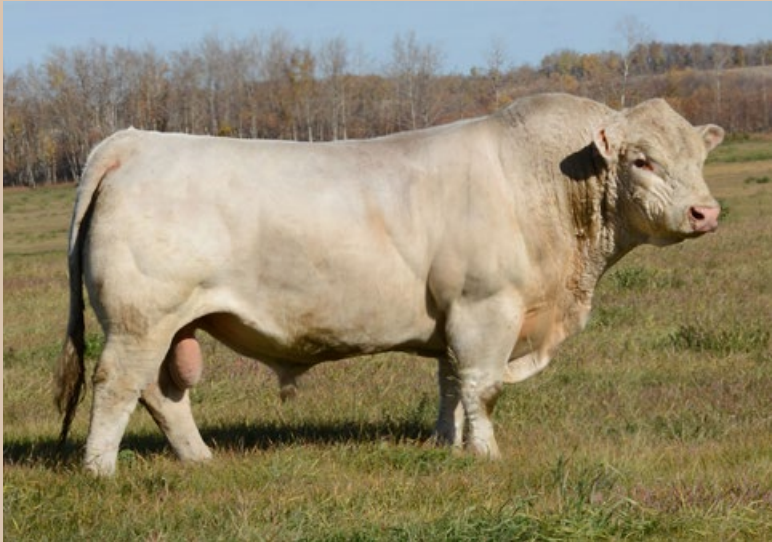
HVA Threetheives 66F, reg# 748515