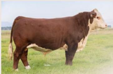
Daybreak 163K, AI safe lots 15, 16