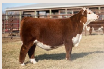
Makers Mark 2072