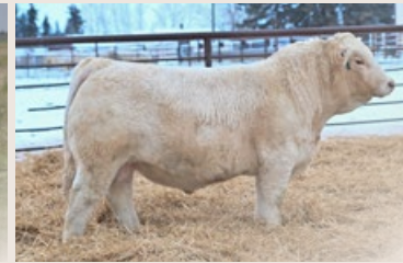
Jackpot 158J, Sire