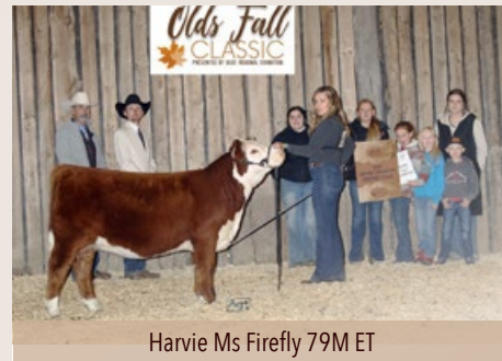
Harvie Ms Firefly 79M ET

Olds Fall Classic Champion Hereford Female Maternal Sibling to 19F