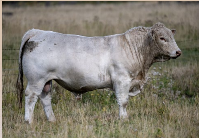
High Bluff Law Maker 56L, reg# 871566

High selling heifer bull at Turnbulls 2022 Bull Sale