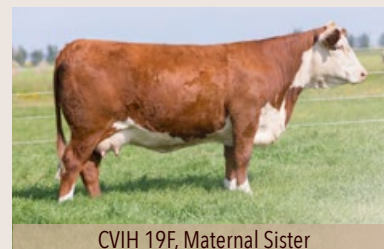
CVIH 19F, Maternal Sister