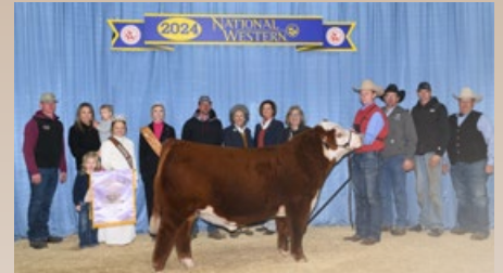
NWSS Res National Champion, Sire

H 3 EXPORTABLE EMBRYOS 23C MS MEDONTE 236D X CSC 701 OSHOTO 316