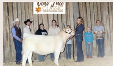
Rs Champion Female, Lot 19

Ms Molson 19M is the very first Ms Molson female to sell off our ranch in years. We hold on to our Ms Molson's pretty close as they have produced year after year, big-bodied, correct and attractive offspring, Ms Molson's also have a track record in the show ring. We look forward to having this beauty out this fall. 19M's grand dam was a dominating force in the showing. The Jackpot bull stamped his offspring so well, with added performance, style and overall mass. Ms Molson 19M was the Olds Fall Classic Sr. Heifer Calf Champion and Reserve Champion Charolais Female. She made many friends in and out of the breed. Quite simply she is flawless. Look for her at Farmfair Internation and we are reserving her show rights until after CWA Agribition 2024.