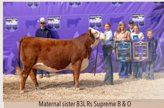
Maternal sister 83L Rs Supreme B & O