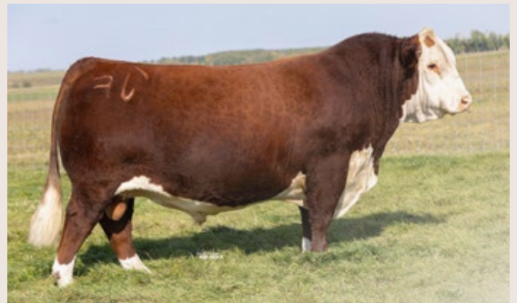
Commitment 137J CWA Supreme Top 10 Bull