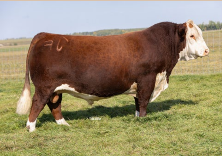
NJW PMH Commitment 137J ET, reg# C03098663