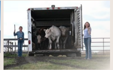
Jade 45M, Show Ready!