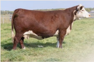
Dam of Lot 2