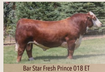
Bar Star Fresh Prince 018 ET