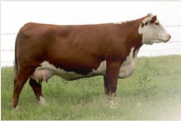
Unique 80W, Granddam Lot 11