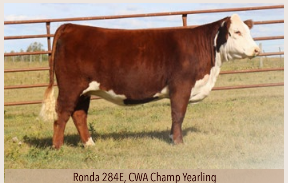
Ronda 284E, CWA Champ Yearling