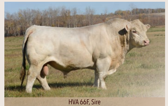
HVA 66F, Sire