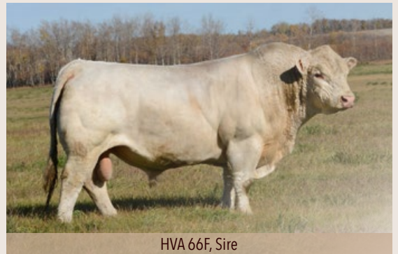
HVA 66F, Sire