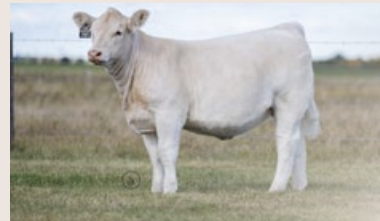
Alternate View of Lot 19