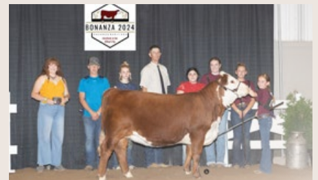
Embryo Full Sibs Princess 177L