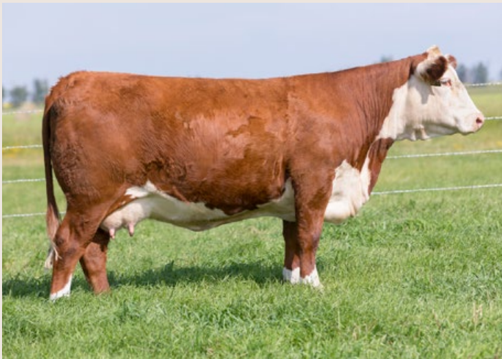
Harvie Ms Firefly 19F Reg # C03048878

HARVIE MS FIREFLY 84F X NJW 73S D287 DAYBREAK 163K ET