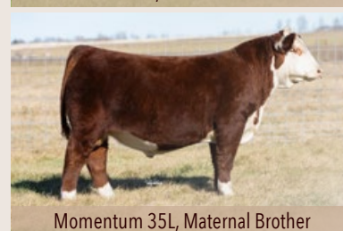
Momentum 35L, Maternal Brother