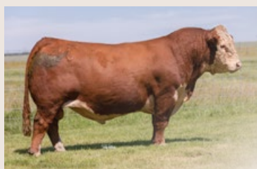
Bourbon, Maternal grandsire of Lot 5