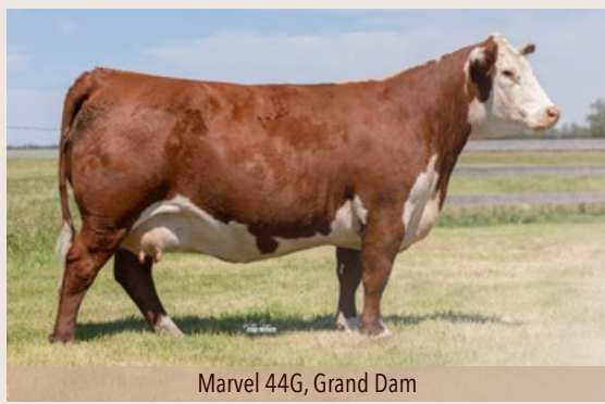
Marvel 44G, Grand Dam