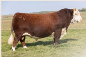
Sire of Lot 15 and 16