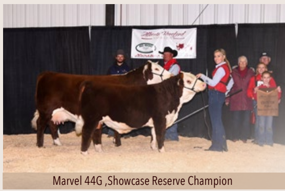
Marvel 44G ,Showcase Reserve Champion

A Marvel 44G granddaughter that is super flashy and easy on the eyes. She's another example of how Maker's Mark added attractive sleek front ends to our power-based females. Another great prospect for the upcoming 2025 show season. She's correct, wide topped yet angular in her front. She's always striking a pose! All the heifer calves are halter broke and ready for Bonanza 2025 in Olds, Alberta!