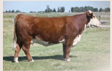
Monique 89J, Dam Lot 12