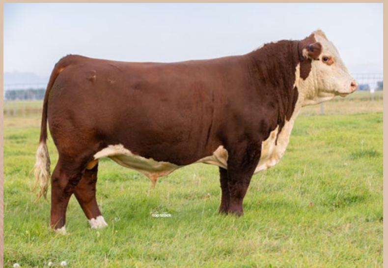
NJW 73S D287 Daybreak 163K ET, reg# C03108515

One of the high selling bulls at the 2023 NJW Bull Sale