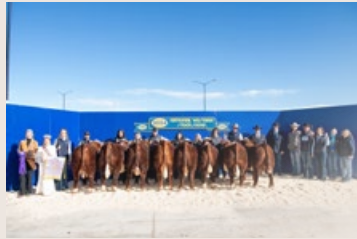
Sire Lot 3, '23 NWSS Carload Champion