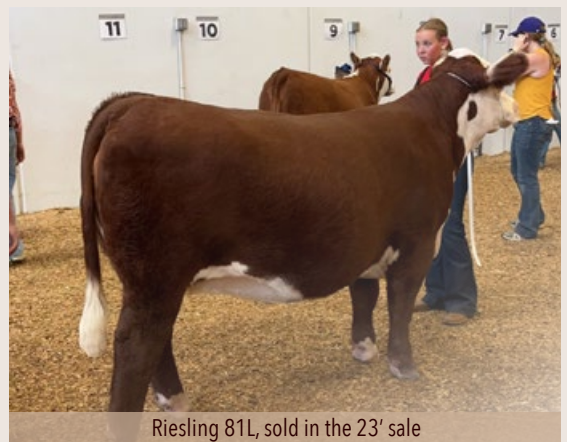
Riesling 81L, sold in the 23' sale