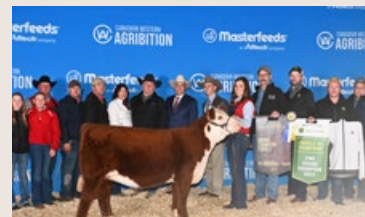
Full Sister, CWA Champion Horned Female